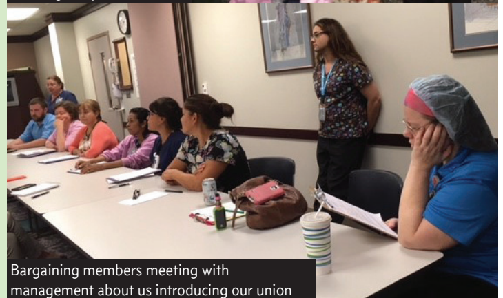
Bargaining members meeting with management about us introducing our union