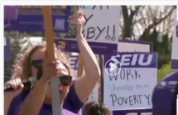
MultiCare healthcare workers in Yakima picket for higher wages